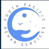
South Pacific Rehab