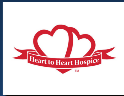
Heart to Heart Hospice